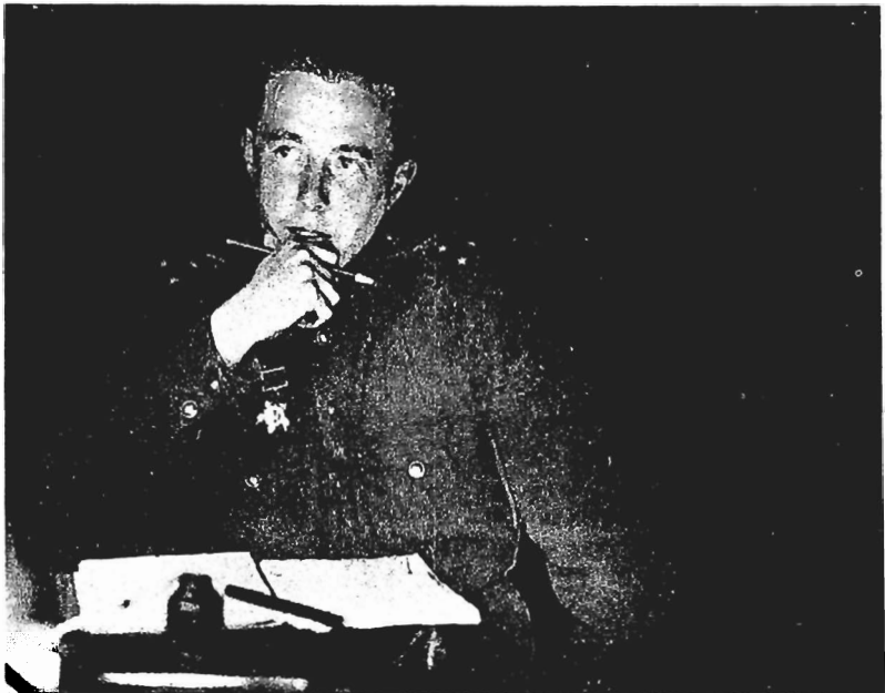
Aleksandr Isayevich Solzhenitsyn—in the army