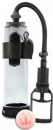
#4 Vibrating, performance pump