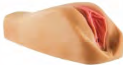
#8 Latin Lifelike Pussy