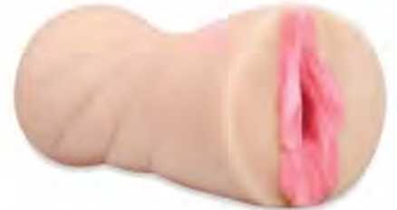
#3 Real feeling MILF