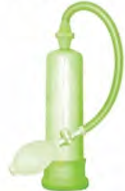
#6 Bigger, harder erections