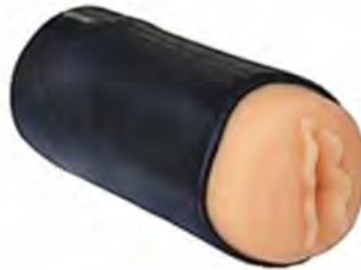
#2 "real skin" vagina