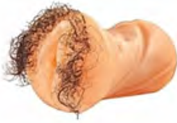
#1 Tight, hairy pussy