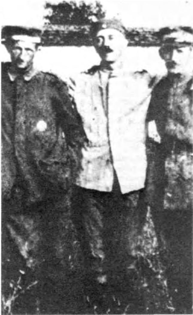
Corporal Adolf Hitler in Flanders (middle) during the First World War. He was always persuading his comrades about a need to: "put the Steel Helmet on in order to rescue the German Nation from the Jewish International Apostles of Equality.