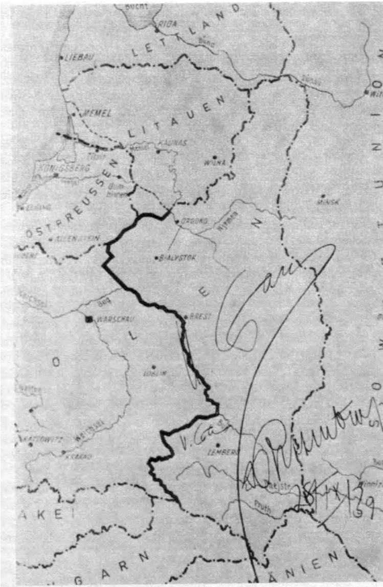
Five weeks after the German-Soviet Non-Aggression Pact, which in fact was an Aggression Pact, on September 28, 1939 the comrades Stalin and Ribbentrop put their signatures on the map which shows Poland being sized by both of them and then divided.