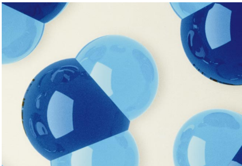
The meaning of life? Water molecules are involved in the biology of all life-forms on Earth. That might not be true on other planets.

The apparent ‘specialness’ of water was pointed out in 1913 by the American biochemist Lawrence Henderson, who argued that the Universe seems remarkably ‘fit’ to