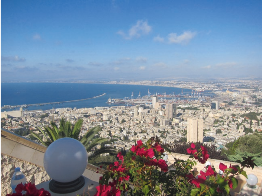
Picture A5 Haifa Landscape: Contrasts. (color online)