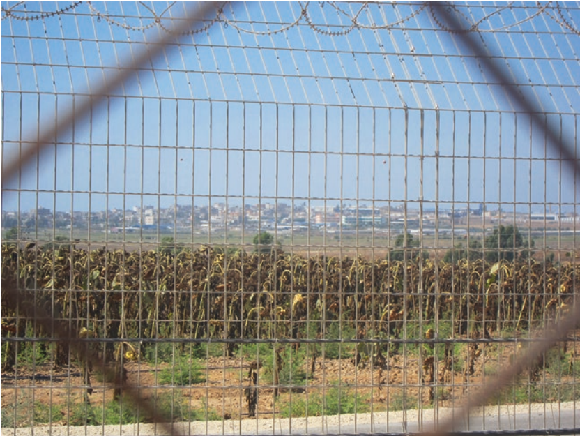
Picture A1 Gaza Strip Isolation Fence. (color online)

1 All pictures reproduced in the Appendix C were taken by the author during her fieldwork trips to Israel and Palestine in 2015 and 2016.