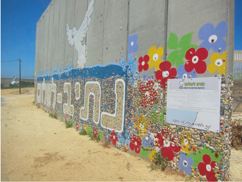
Picture A2 Gaza Separation Wall “Path to Peace”. (Source: Gaza Separation Wall, Netiv HaAsarah, Israel) (color online)