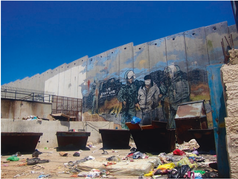
Picture A3 Aida Refugee Camp Wall “We Can’t Live”. (Source: Separation Wall, Aida Refugee Camp, Bethlehem, Palestine) (color online)