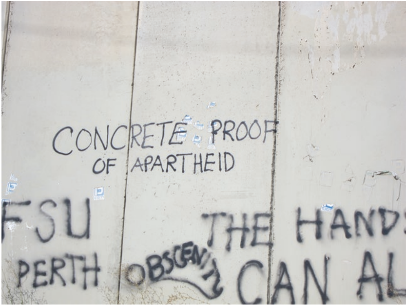
Picture A4 Bethlehem Separation Wall “Concrete Proof of Apartheid”. (color online)