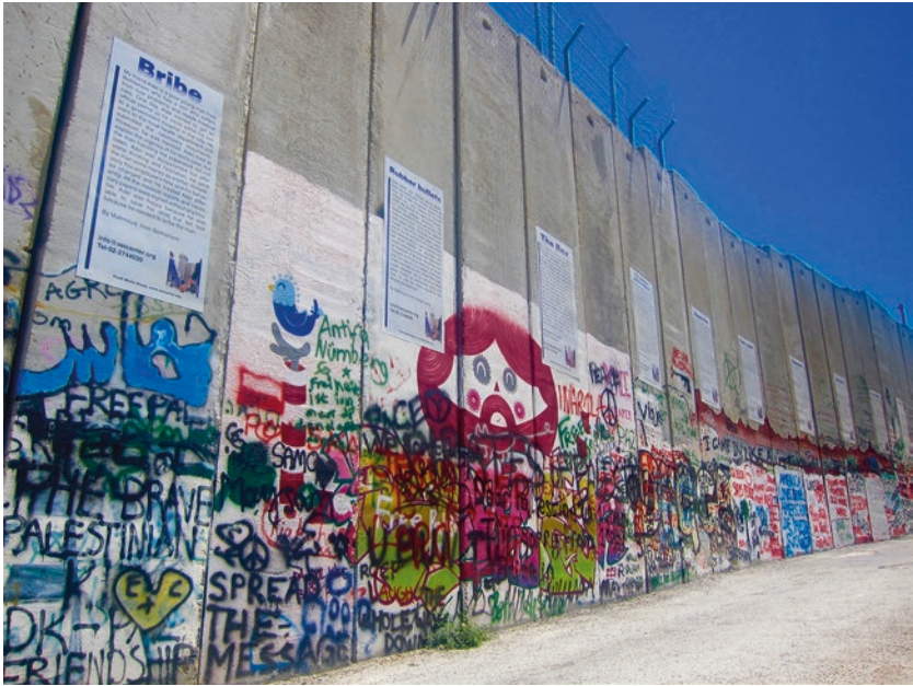
Picture A8 Separation Wall Graffiti. (Source: Separation Wall, Bethlehem, Palestine) (color online)