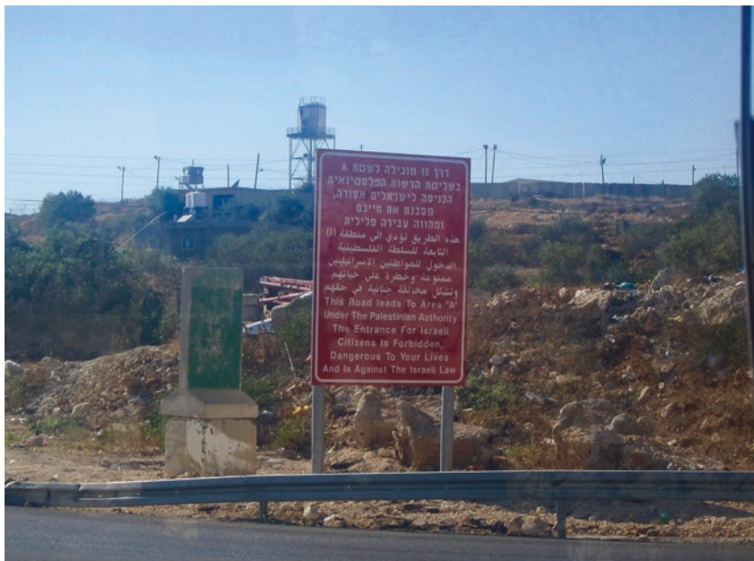
Picture A7 Movement Control “Dangerous to Your Lives”. (Source: Road Sign, West Bank, West Bank, Palestine) (color online)