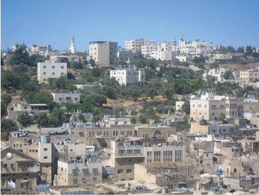
Picture A6 Ramallah Landscape: Rooftop Water Tanks. (color online)