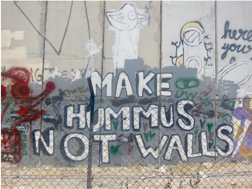
Picture A9 Separation Wall Graffiti “Make Hummus Not Walls”. (color online)