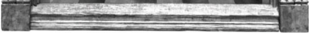
FIGURE 3. Fernando Gallego, Christ Blessing , 1494–1496.

Rizi would certainly have been familiar with such depictions of Synagogue and Ecclesia and he used their symbolic imagery in his painting. The artist juxtaposes female youth and old age, contrasting Beatriz Enríquez's youth and beauty with the ugliness of an old female character sitting at the foreground of the canvas. The subject matter of the old woman is common in Rizi's paintings. We see the old woman in both of his paintings of Presentación de Jesús en el Templo . However, Rizi hides the old woman, locating her behind other subjects, almost outside the frame of the paintings, as if she were unimportant. In his other paintings, the old woman is portrayed as a negative of her opposite young self and becomes the marginalized subject.