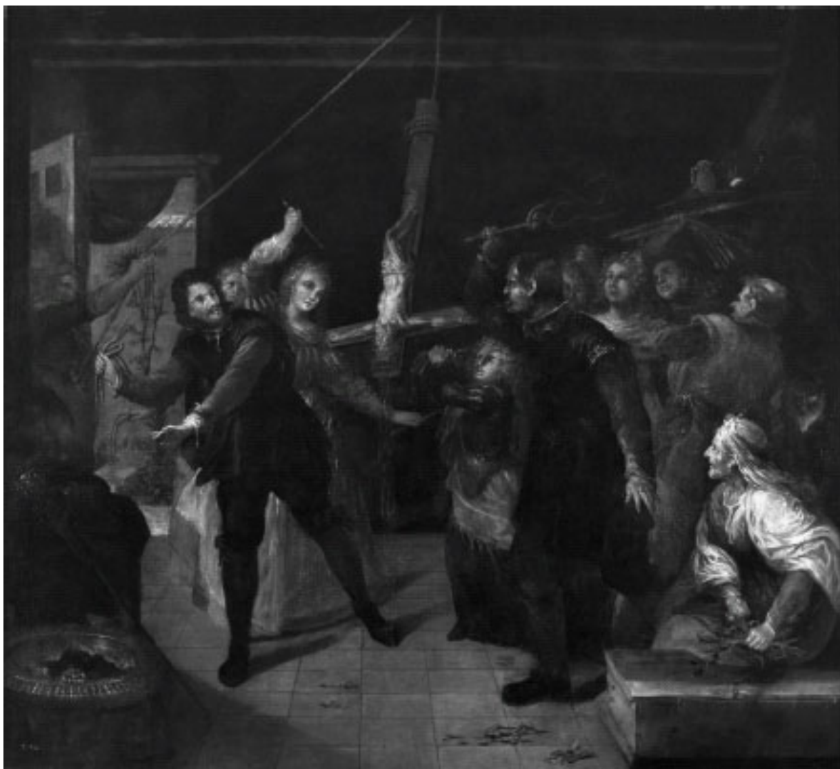
FIGURE 1. Francisco Rizi, Profanación de un crucifijo o Familia de herejes azotando un crucifijo , 1651.

the Las Infantas case and possible influences for Rizi's portrayal (fig. 2).