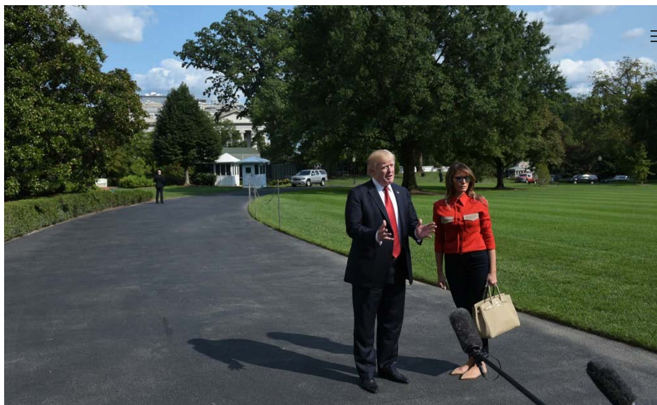
President Donald Trump speaks about Hurricane Irma, as first lady Melania Trump looks on, upon return to the White House in Washington on Sept. 10, 2017. Trump returned after spending the weekend at the Camp David presidential retreat.

As Trump's address to his cabinet makes clear, however, Irma only makes him want to double down on his reckless economic agenda. Flanked by Secretary of State Rex Tillerson and Commerce Secretary Wilbur Ross, he explained that they were going to discuss "dramatic tax cuts and tax reform. And I think now with what's happened with the hurricane, I'm gonna ask for a speed up."