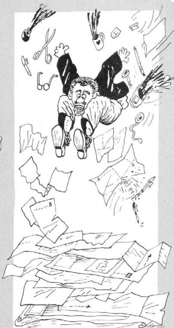
AL JAFFEE AND HIS FOLD-INS