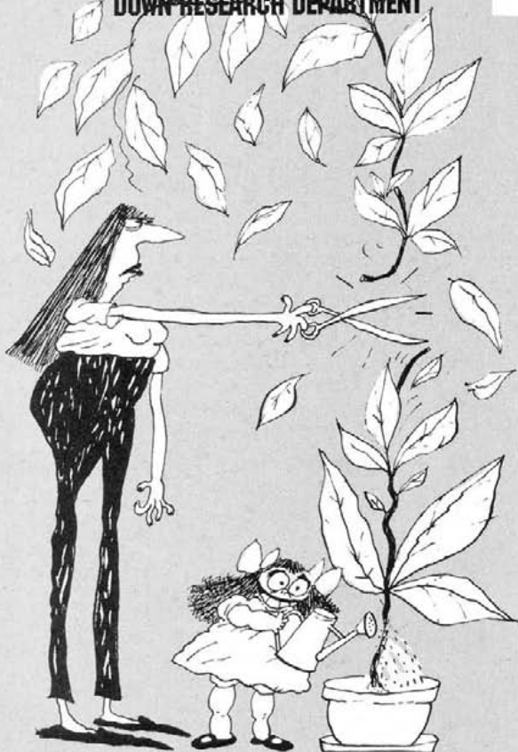
PRIZE WINNING AVOCADO PIT GROWER

A MAD REPORT FROM OUR BURNED OUT AND BROKEN DOWN RESEARCH DEPARTMENT