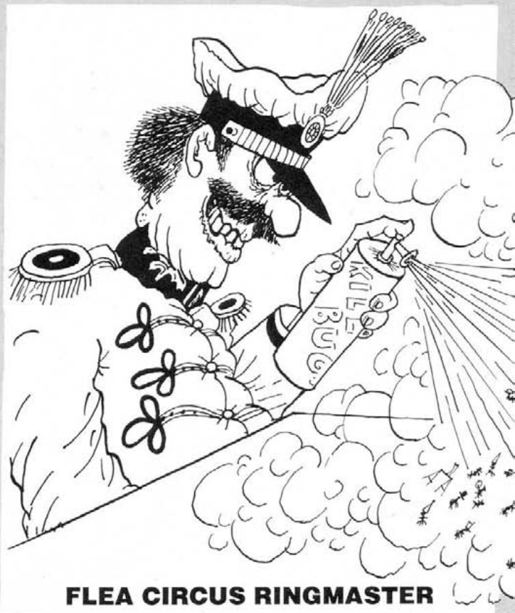
FLEA CIRCUS RINGMASTER