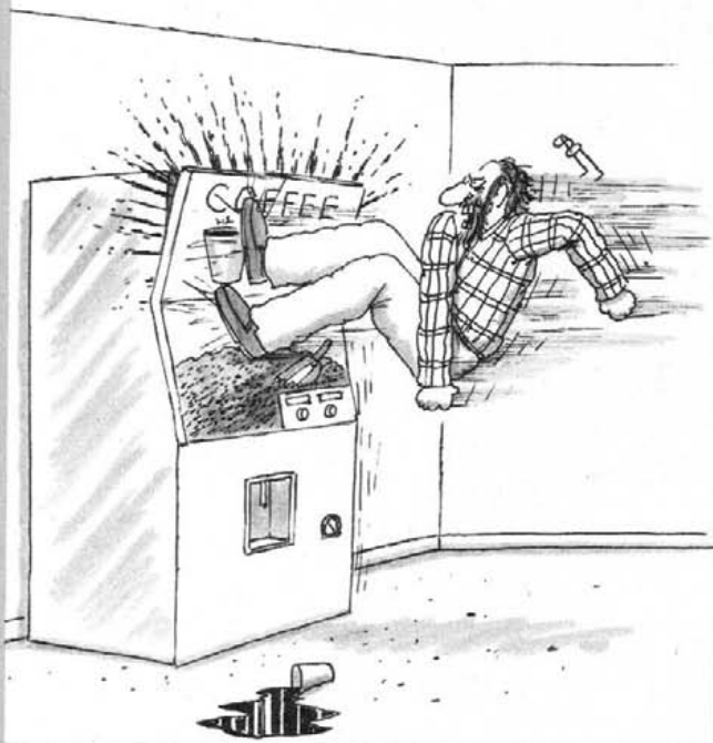
THE COLD COFFEE FLYING DOUBLE STOMP