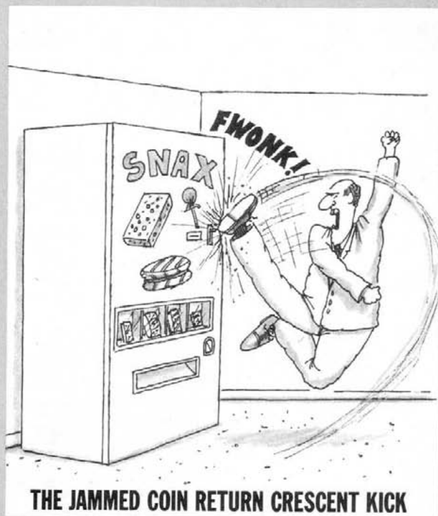
THE JAMMED COIN RETURN CRESCENT KICK