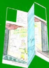
FOLD PAGE OVER LIKE THIS!

From the time we were old enough to understand, we were all taught that breaking the law does not pay because it leads to shame and punishment. However, lately we've noticed that this is quite the opposite for some lawbreakers. To find out how they're making out, fold in page.