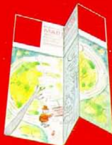
FOLD PAGE OVER LIKE THIS!

Humpty Dumpty fends off some pretty stupid questions in this Mother Goose scene . . . but to get the FINAL SNAPPY ANSWER, you've got to fold in the page as shown at right!