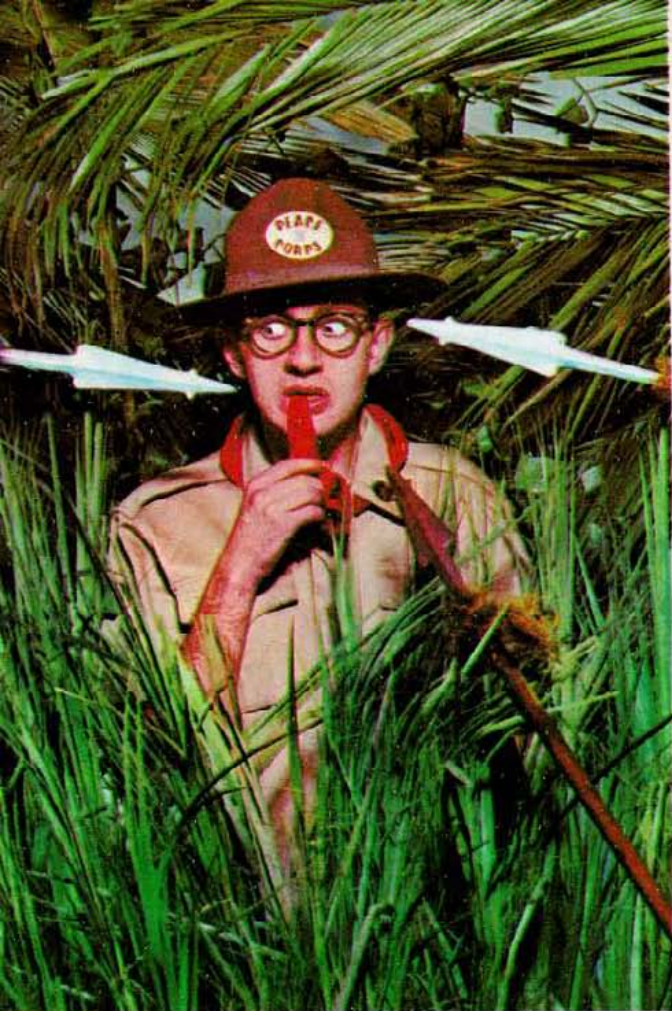
PHOTOGRAPHED AT FREEDOMLAND. NEW YORK