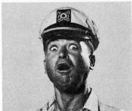
Humphrey Blowgut stars on The Belate Show