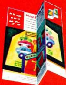
FOLD PAGE OVER LIKE THIS!

For generations, Americans have been conditioned to "Big Car" thinking. But now, the energy crisis has ended that. Yet, the "Big Car" appeal still lingers on. One feature that's sure to appear in smaller cars will also appear when you fold in the page as shown at right.