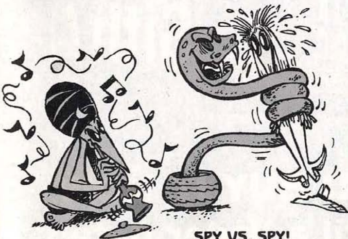
SPY VS. SPY! PAGES 30, 91