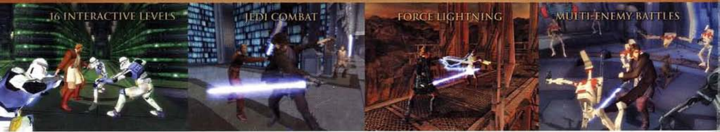
16 INTERACTIVE LEVELS

AVAILABLE NOW THE ULTIMATE JEDI ACTION EXPERIENCE.