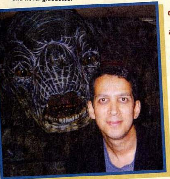
Another perfectly lovely photo at the Sears Portrait Studio, ruined by an overzealous fan.

A: Hard Knocks, but I lost my Pell grant and never graduated.