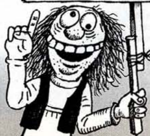
ILLUSTRATION OF TOM BUNK BY TOM BUNK