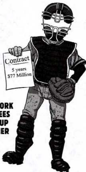
NEW YORK YANKEES BACKUP CATCHER