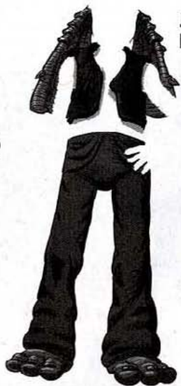
JAR JAR BINKS IN STAR WARS: EPISODE II