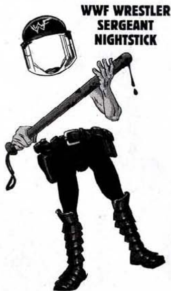
WWF WRESTLER SERGEANT NIGHTSTICK