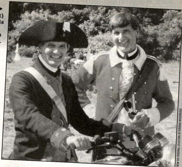
FROM THE PERSONAL COLLECTION OF DEBORAH WOODBRIDGE