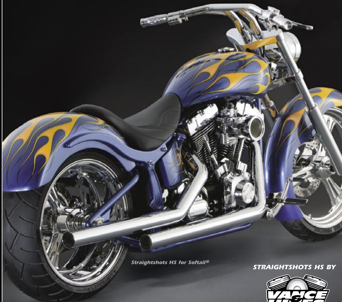
Straightshots HS for Softail®