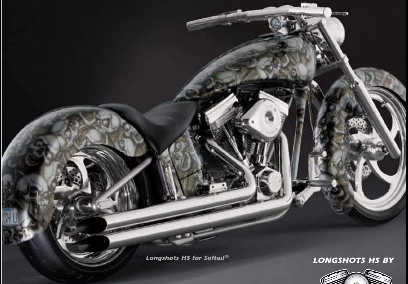
Longshots HS for Softail®

A look that created a legacy for all others to follow. Vance & Hines revolutionized the Harley® exhaust marketplace when they first came out with the Longshots. Years later, the look is more popular than ever. Now, virtually "blue-proof", the Longshots HS give you the same great looks and sound you've grown to love, and more. Drenched in Vance & Hines show quality chrome, massive 2 1/2" diameter plasma-arc cut full coverage header and muffler heat shields house the Longshots HS and make this system virtually "blue-proof" for miles. Scalloped cut ends finish off the look.