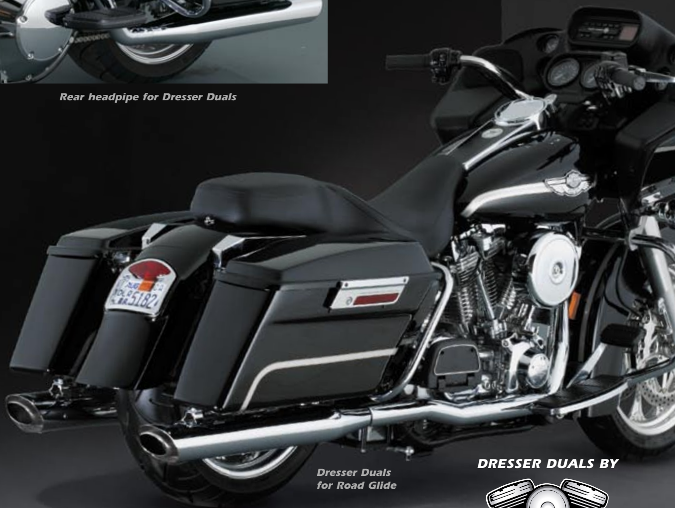
Dresser Duals for Road Glide