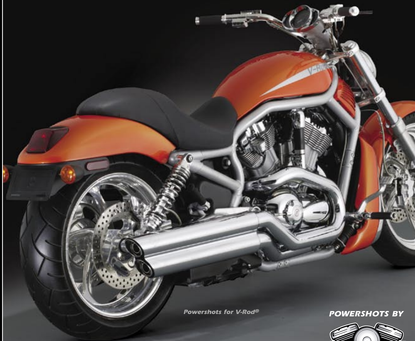
Powershots for V-Rod®

The only exhaust system truly worthy of a V-Rod®. Dual power chambers. Slip-on design. Two 2 1/2" muffler bodies complete with removable baffles produce one sweet sound. Includes a single chrome 360° heat shield and unique dual staggered, twin layered slash-cut ends. Slip-on design features the Power Chamber crossover system for horsepower and torque.