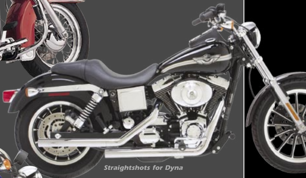
Straightshots for Dyna