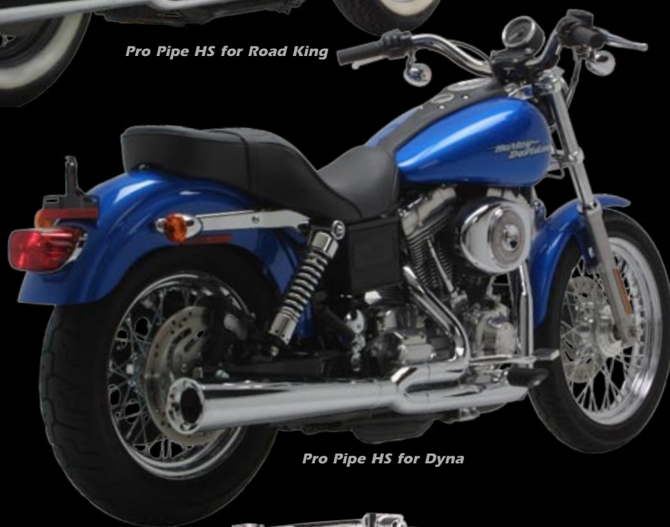
Pro Pipe HS for Dyna