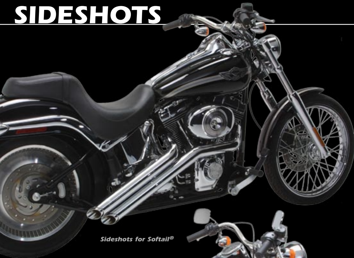
Sideshots for Softail®