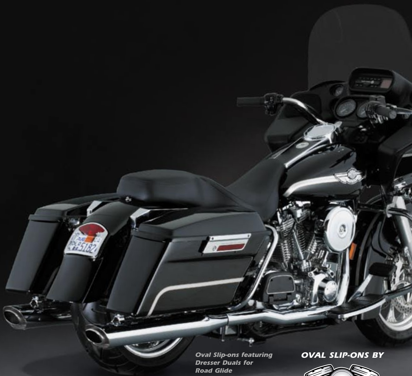
Oval Slip-ons featuring Dresser Duals for Road Glide