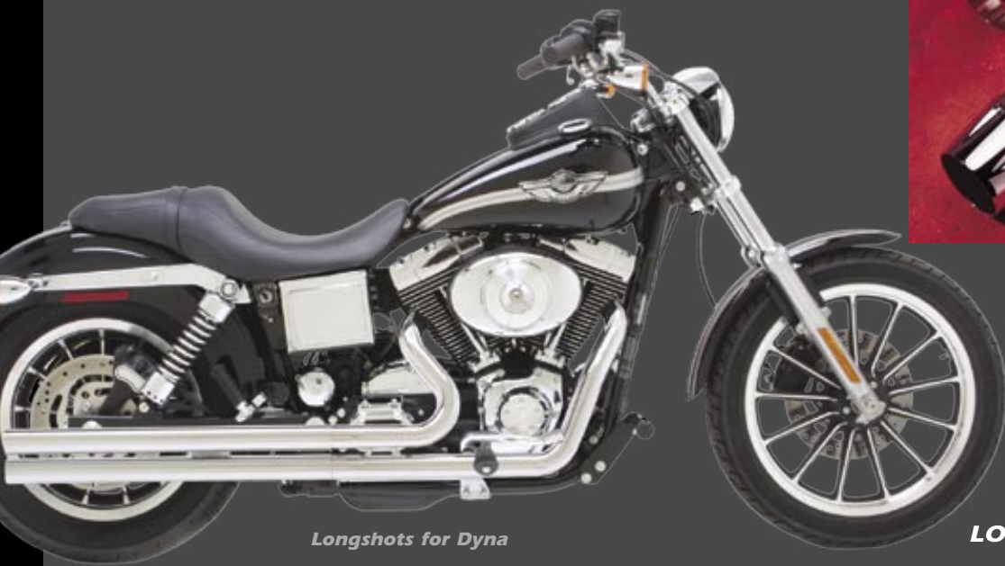
Longshots for Dyna