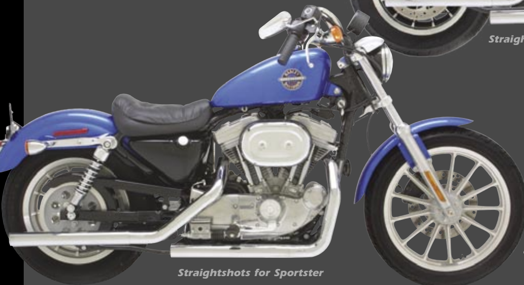
Straightshots for Sportster