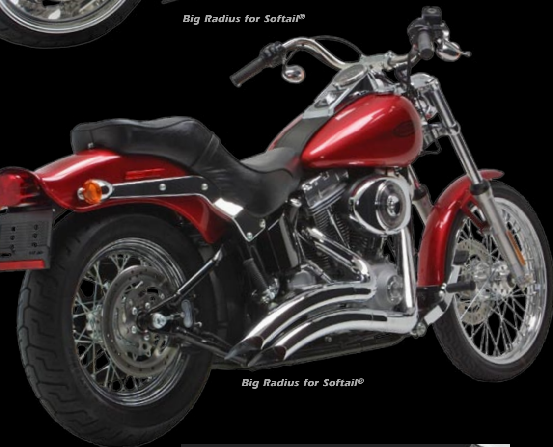
Big Radius for Softail®

Yes, it's all there. Dyno-tuned, curved headpipes and matching curved, removable baffles. All hidden behind beautifully curved 220° full coverage headpipe and muffler heat shields.