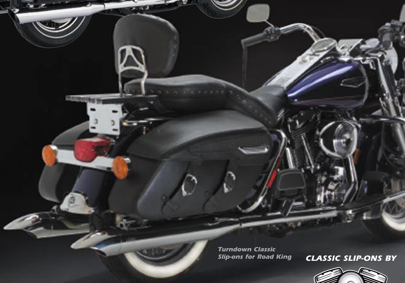
Turn-down Classic Slip-ons for Road King