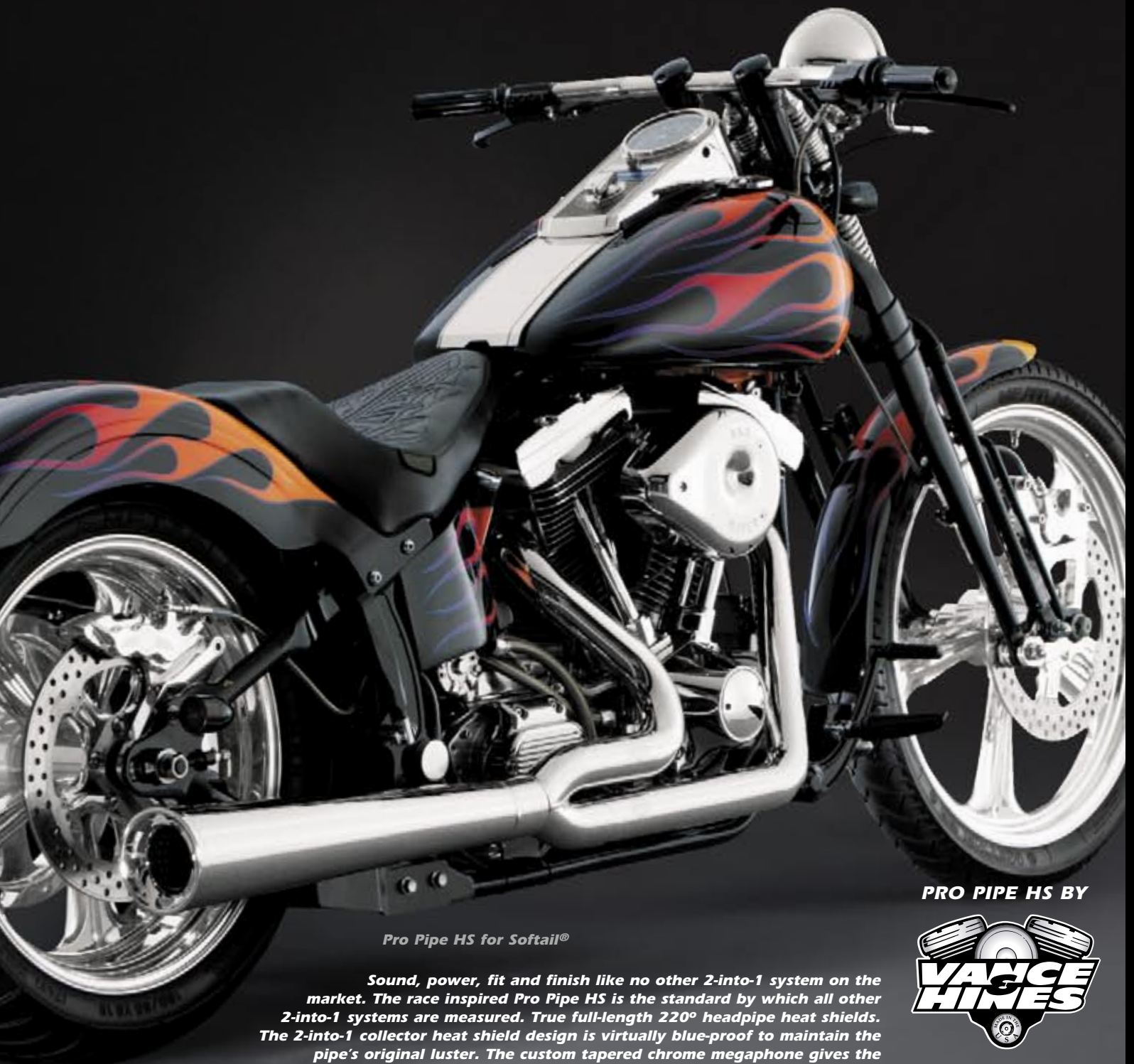
Pro Pipe HS for Softail®

Sound, power, fit and finish like no other 2-into-1 system on the market. The race inspired Pro Pipe HS is the standard by which all other 2-into-1 systems are measured. True full-length 220° headpipe heat shields. The 2-into-1 collector heat shield design is virtually blue-proof to maintain the pipe's original luster. The custom tapered chrome megaphone gives the Pro Pipe distinctive style with incredible performance and power. A meticulously designed billet end treatment finishes off the look.