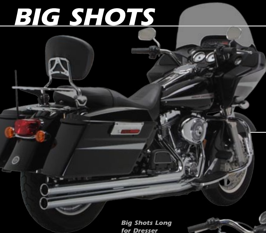
Big Shots Long for Dresser