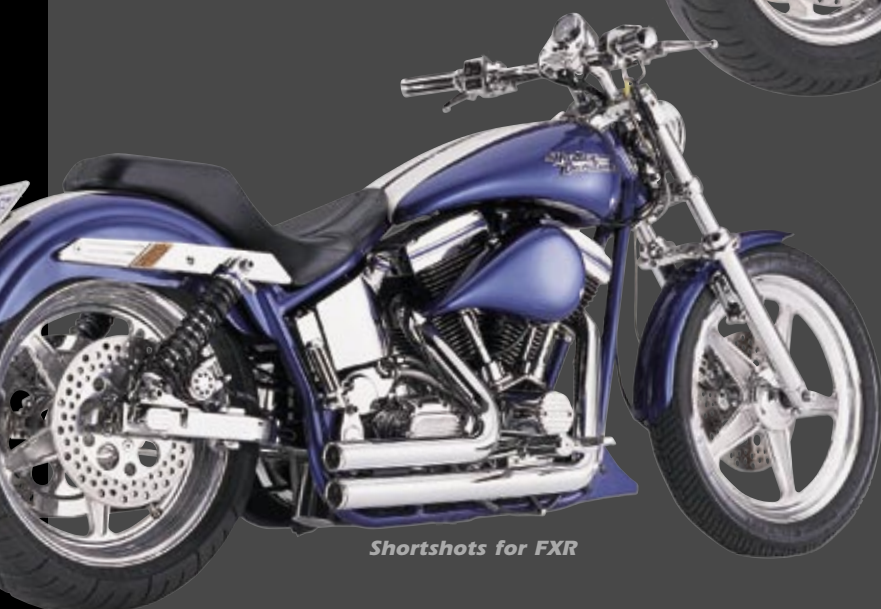
Shortshots for FXR

Shortshots share many of the famed Straightshots features, except in a shorty version for a short-piped, hot-rod-bike look. The 1 3 / 4 " headpipes exit at the end of the frame just in front of the rear wheel. Full coverage 220° heat shields run all the way back to the meticulously finished end caps.