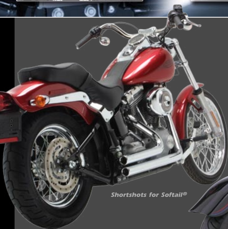
Shortshots for Softail®