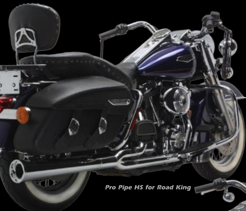
Pro Pipe HS for Road King