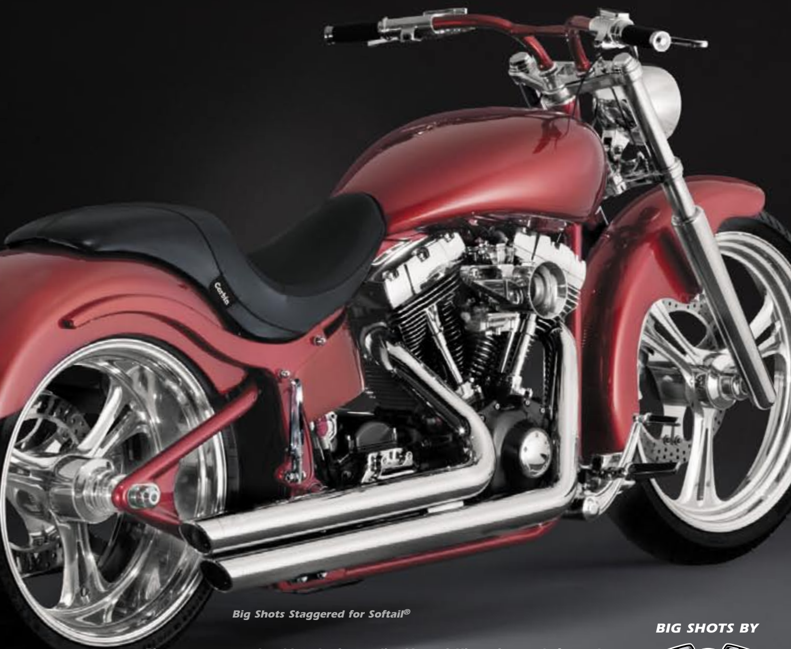
Big Shots Staggered for Softail®

Big on power, sound and long-lasting quality. Vance & Hines pioneered aftermarket full-coverage heat shields and the Big Shots continue the tradition. Massive 2 1/2" robotic plasma-arc cut full-length header and muffler heat shields make Big Shots virtually blue-proof. Big Shots Staggered and Long systems feature the innovative Power Chamber. The race-inspired Power Chamber is a unique crossover system that delivers all the power and performance advantages of a 2-into-1 race system, yet keeps the intimidating look of a 2-into-2 drag pipe. All Big Shots systems come complete with meticulously finished billet end caps. Big Shots Staggered systems come complete with stylized billet slash-cut end tips, which are customizable in two 90° directions. Big Shots Standard and Long systems come with traditional straight billet end tips.