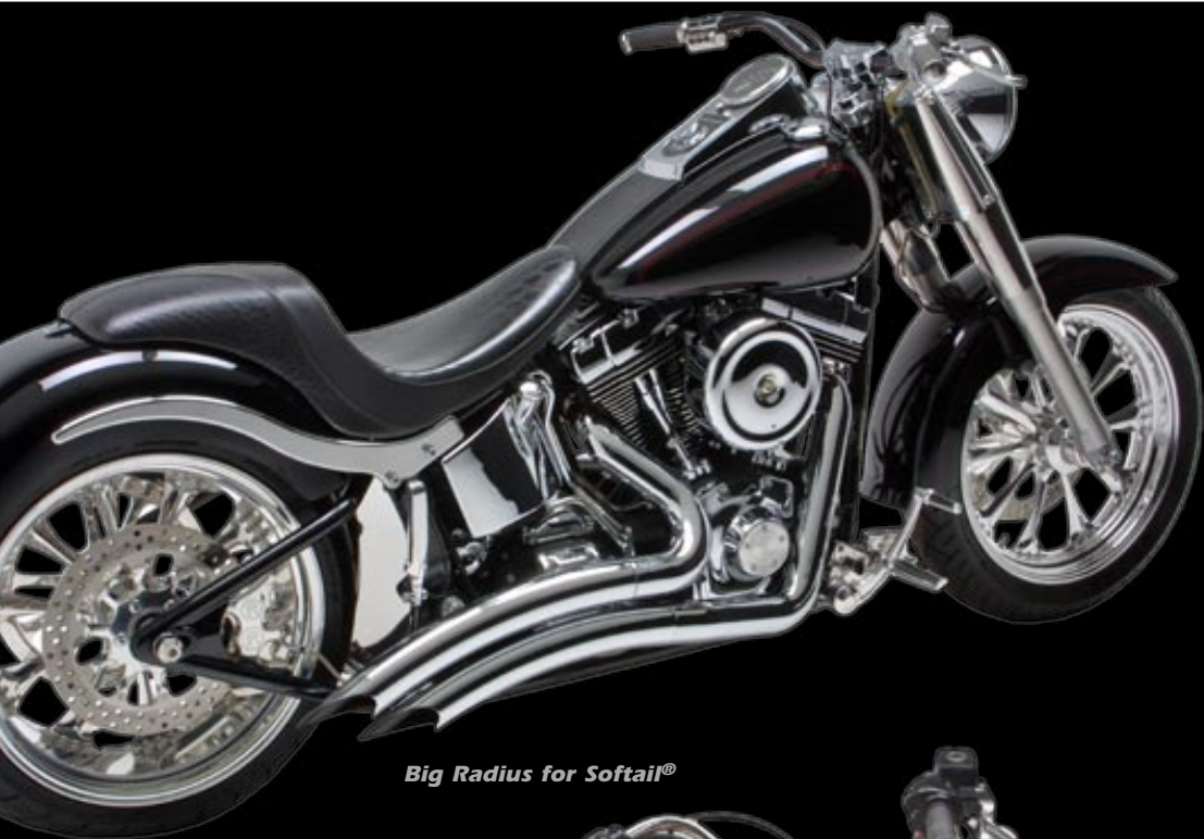
Big Radius for Softail®