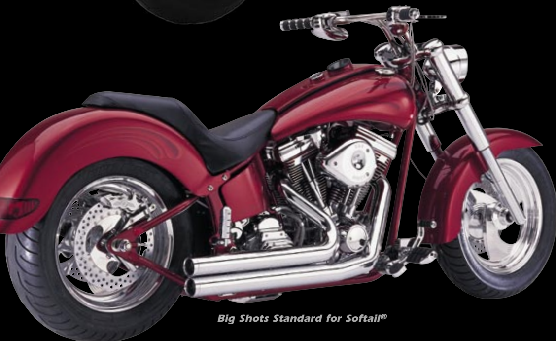
Big Shots Standard for Softail®