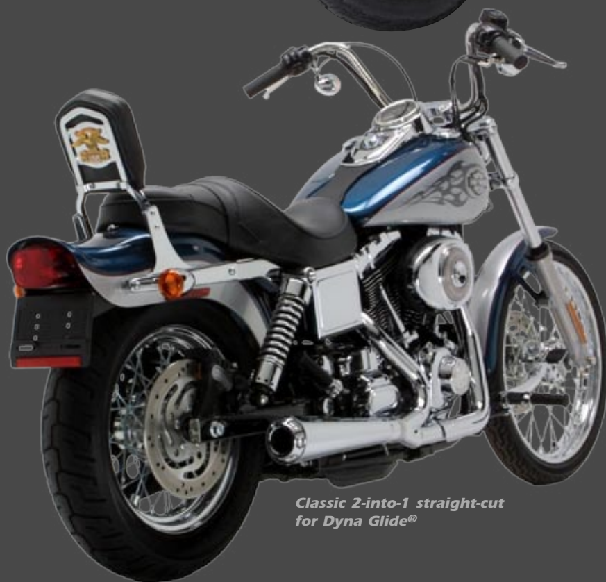
Classic 2-into-1 straight-cut for Dyna Glide®

A 2-into-1 with great style and outstanding performance. Once you hit the throttle, you'll instantly feel the increased torque and power gains over stock. Feature 220° 3 / 4 length heat shields that are plasma-arc cut from custom tubing. Every Classic system includes round, solid billet aluminum end caps that are precision CNC-machined, then highly polished and double-nickel chrome-plated.