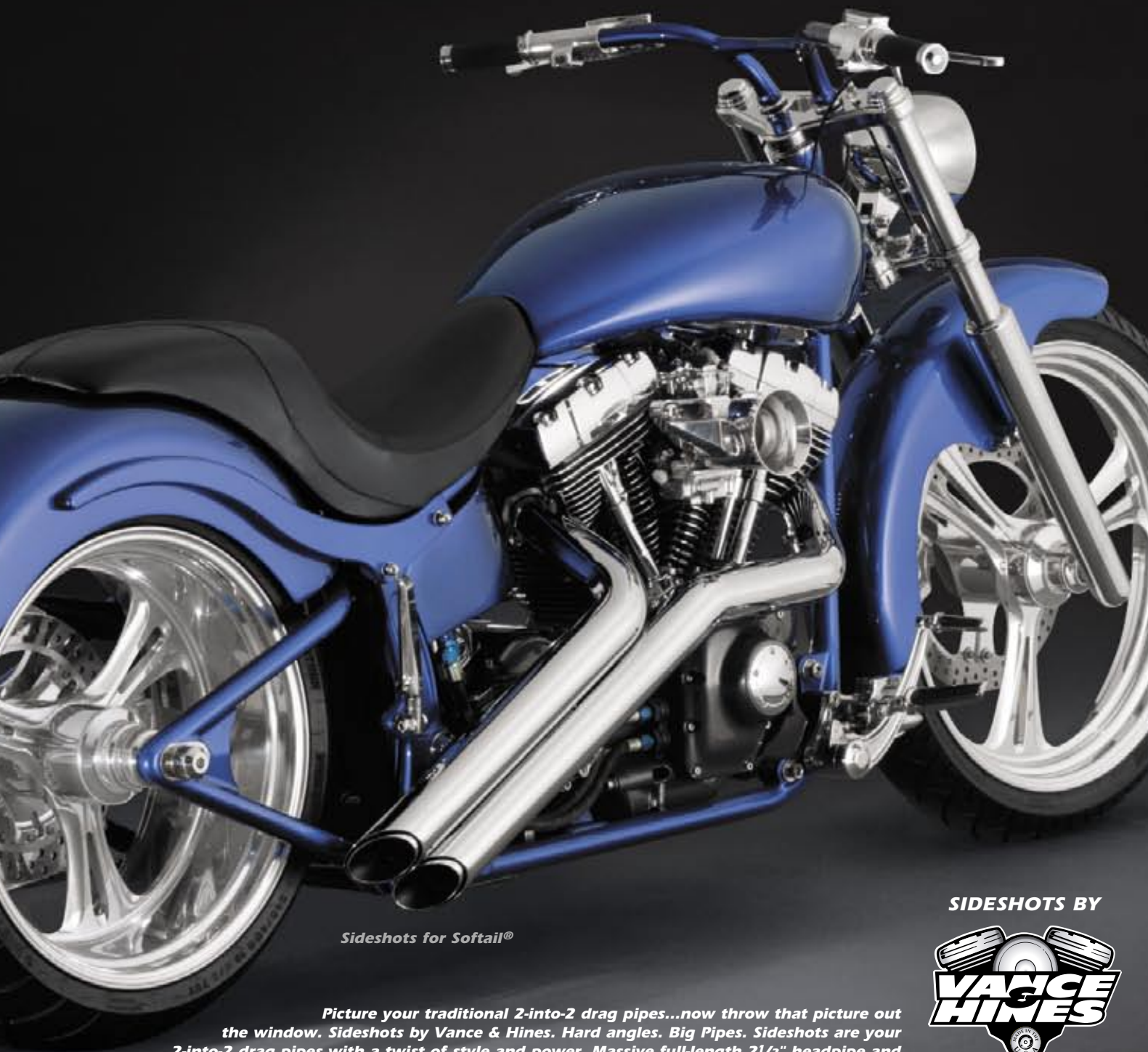
Sideshots for Softail®

Picture your traditional 2-into-2 drag pipes...now throw that picture out the window. Sideshots by Vance & Hines. Hard angles. Big Pipes. Sideshots are your 2-into-2 drag pipes with a twist of style and power. Massive full-length 2 1/2" headpipe and muffler heat shields make the system virtually blue-proof. The signature hot-rod sound doesn't miss a beat with increased horsepower and torque served up by Power Chamber technology. Twin slash-cut ends are added to finish off the look.