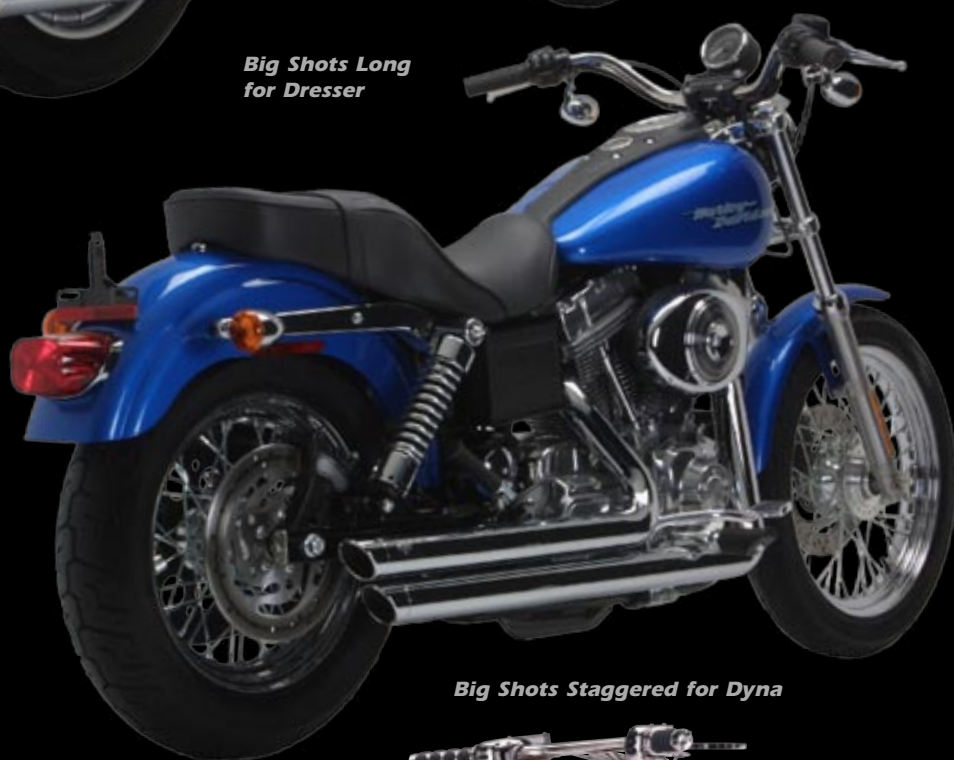
Big Shots Staggered for Dyna