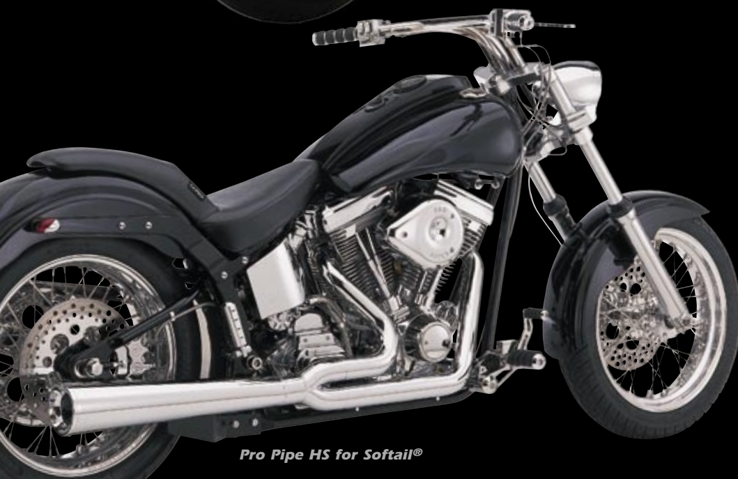
Pro Pipe HS for Softail®