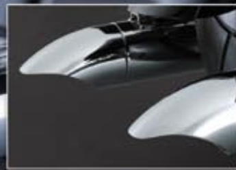
Slash-cut Slip-ons for Road Glide