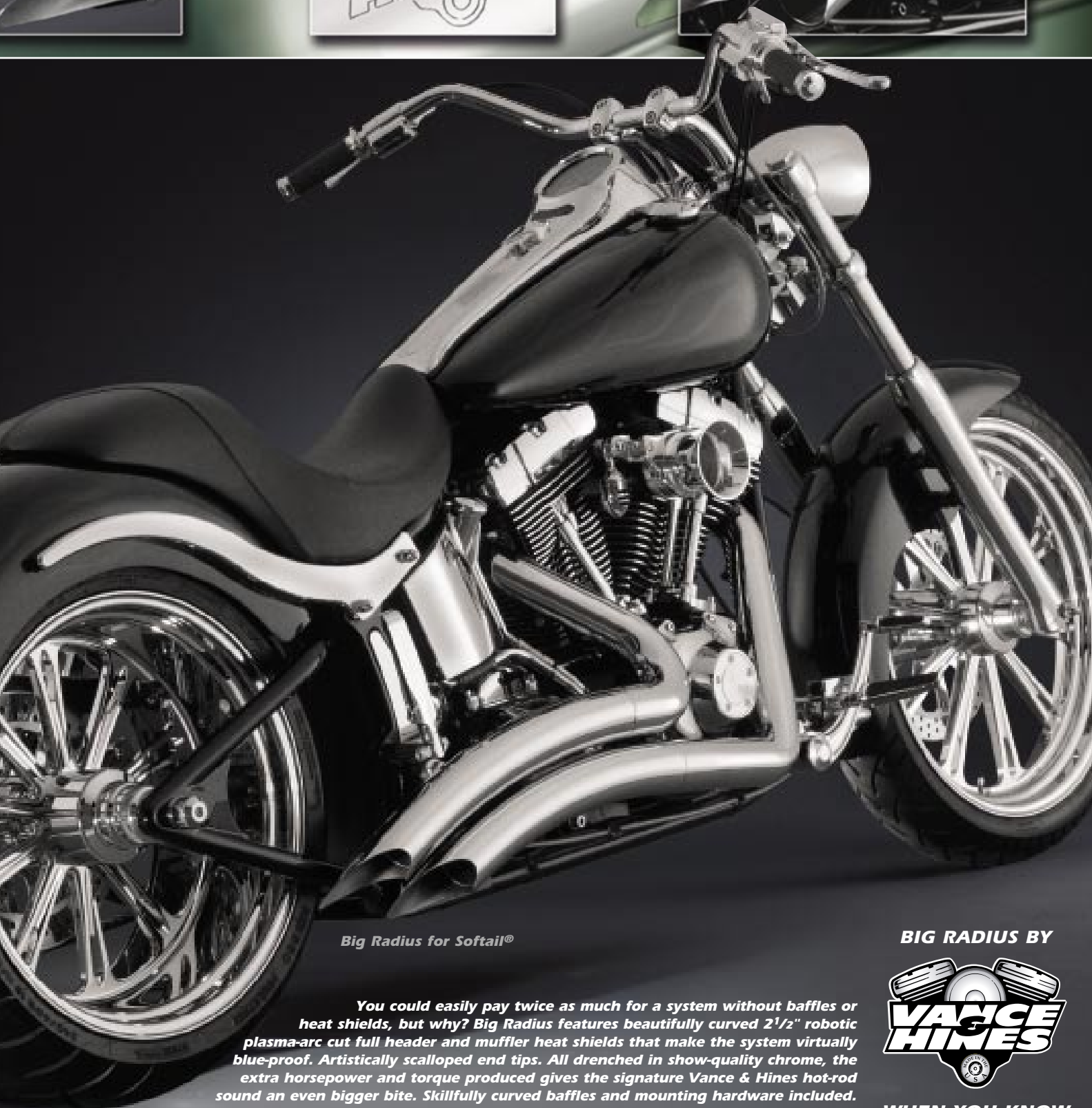
Big Radius for Softail®

You could easily pay twice as much for a system without baffles or heat shields, but why? Big Radius features beautifully curved 2 1/2" robotic plasma-arc cut full header and muffler heat shields that make the system virtually blue-proof. Artistically scalloped end tips. All drenched in show-quality chrome, the extra horsepower and torque produced gives the signature Vance & Hines hot-rod sound an even bigger bite. Skillfully curved baffles and mounting hardware included. Yes, it's all there. Custom looking pipes with heat shields and baffles. The limited production Big Radius...get them while you can.