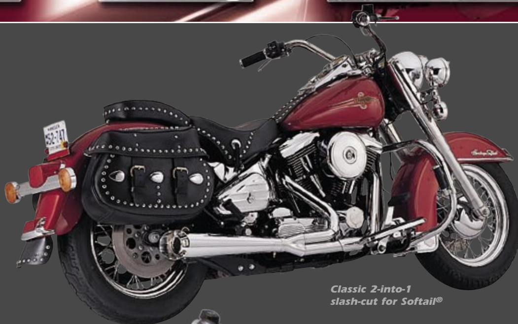
Classic 2-into-1 slash-cut for Softail®