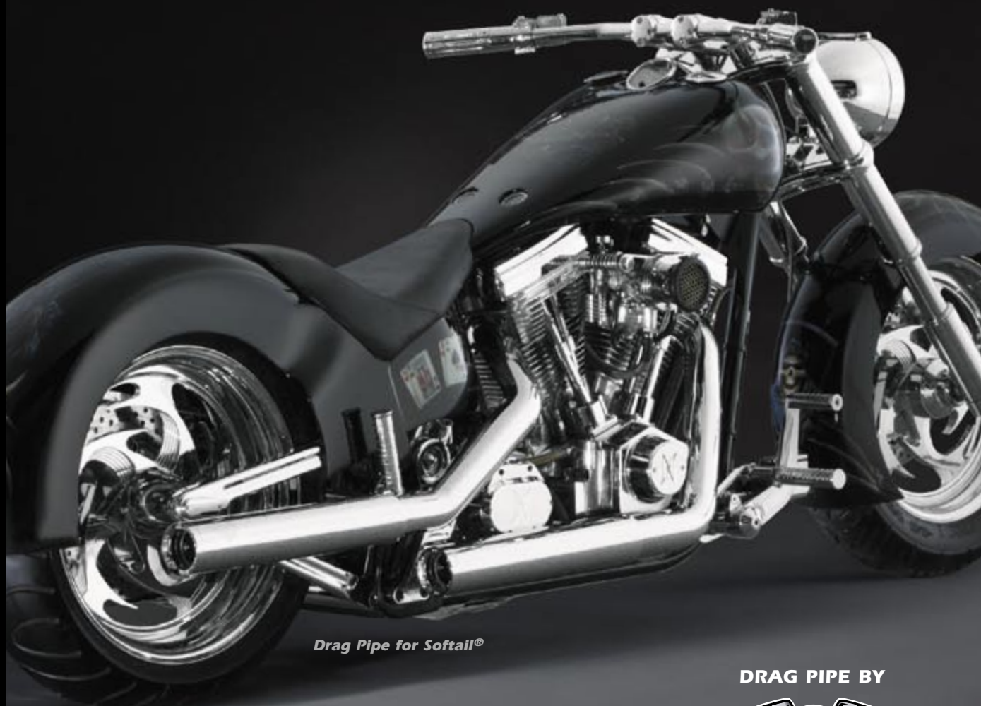
Drag Pipe for Softail®

Need a race only system? Want big power? Want the looks that re-define drag pipes? Oversized mufflers, stepped headers. Full coverage heat shields. Billet tips. All brought together in the new Vance & Hines 2-into-2 stepped Drag Pipe. Only the company that has been racing motorcycles for over 25 years and winning can bring you this quality craftsmanship and racing heritage. The Vance & Hines winning tradition continues with the proprietary bends and steps for increased horsepower and torque, delivering a deep, powerful growl. Full coverage chromed heat shields virtually eliminate blueing pipes on these monster 3" mufflers and stepped headpipes keeping the show-quality look for years to come. It's all finished with Vance & Hines signature billet end tips.