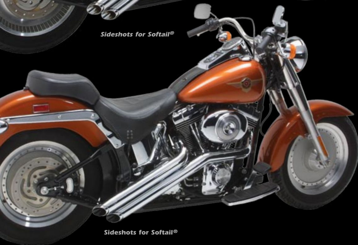
Sideshots for Softail®

Hidden under the heat shields, the Power Chamber uses the volume of both mufflers to improve scavenging of each cylinder for more efficient combustion. The end product is big-time power and sound.