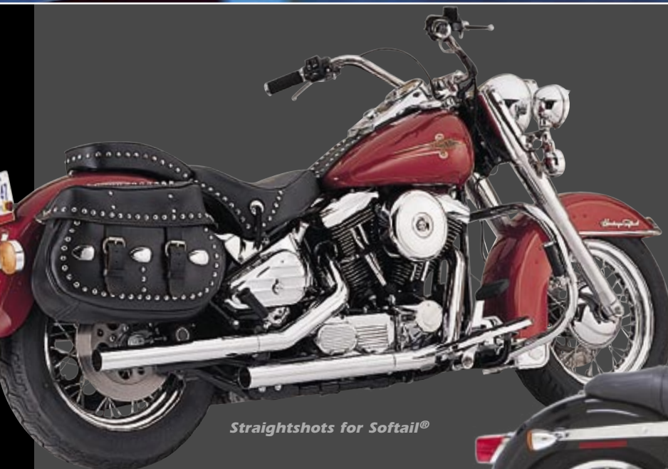
Straightshots for Softail®