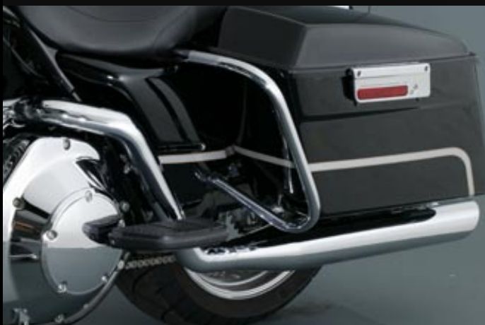
Rear headpipe for Dresser Duals