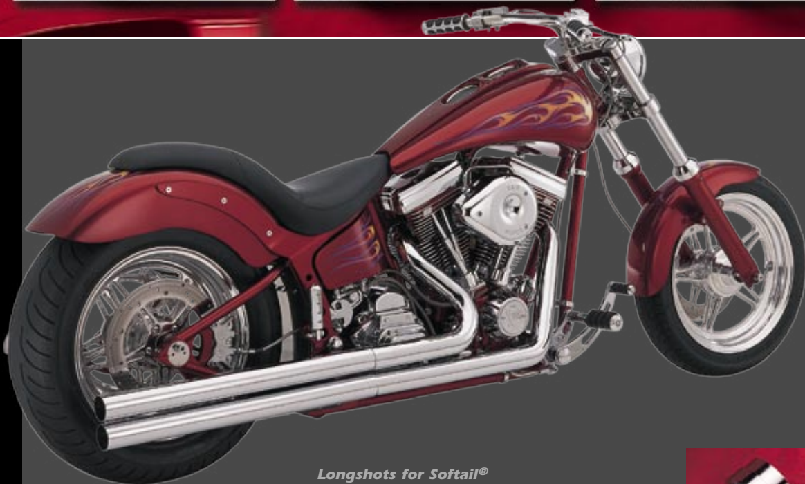
Longshots for Softail®