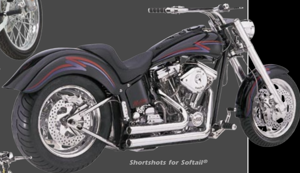
Shortshots for Softail®