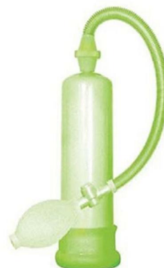
#6 Bigger, harder erections