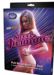
#9 Full Sized Inflatable Doll