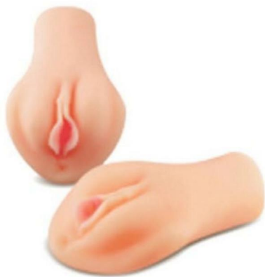
#7 Vibrating Masturbator