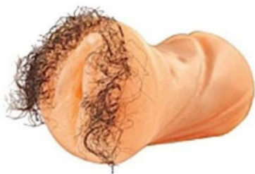
#1 Tight, hairy pussy