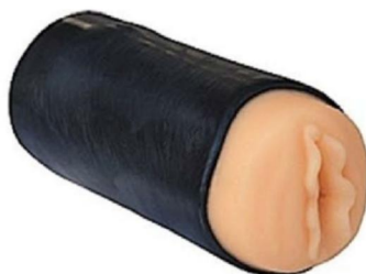
#2 "real skin" vagina