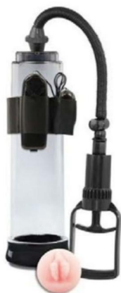
#4 Vibrating, performance pump