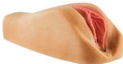
#8 Latin Lifelike Pussy