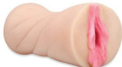
#3 Real feeling MILF